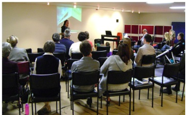
The gathered community at the PCYC.

When the apostle Paul wrote to the church in Ephesus he encouraged these Christians to live as children of light (Ephesians 4:17-5:20). He points out that when we live as children of the light, we expose the fruitless deeds of darkness. As light we proclaim to the world around us: “Wake up, O sleeper, rise from the dead, and Christ will shine on you.” (5:14) As Redeemer Christian Church allows their light to shine, they will declare to those who live in the shadows of the Sleeping Beauty: “Wake up! Rise up! Allow Christ to shine on you.” Like the sleeping beauty in the fairy tale, people will discover true love – not just the love of another person, but best of all, the true love of God. And like the sun that rises across the Huon Valley, a new day will dawn for hundreds, if not thousands of people who will be brought into relationship with Christ through Redeemer Christian Church.