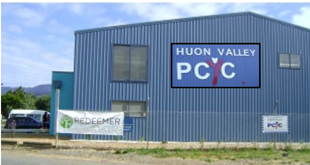
The meeting place of Redeemer Christian Church

Redeemer Christian Church currently is using the facilities of the Police Citizens Youth Centre (PCYC) which is located near the downtown at the end of Heron Street, Huonville. This recently built facility is more than just a sports centre. It was built to be a community centre – a hub for the Huon Valley. The centre is complete with conference rooms, projects centre, a multi-purpose indoor sports centre, gymnasium with weights and aerobics room, a common room with eightball tables, table tennis tables, internet and computer games room, a commercial kitchen and a recording studio for