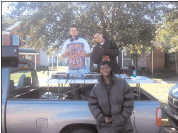
First Southwest Baptist Church has targeted the Hip Hop culture in planting several churches.

Missiologists created the term 10/40 window to describe the geographical region between 10° and 40° latitude, which many consider to be the least evangelized region in the world. The 13/30 window refers to people between the ages of 13 and 30, the largest unreached group of people in the world today.