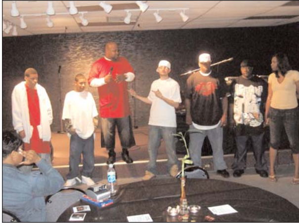
Project Fresh Start has created 16 churches with a goal for the Hip Hop generation to see God as the “ultimate player.”

churches with no building and no money. Small group meetings take place at malls, on college campuses, and even inside hip hop nightclubs. Pastors are called “players” and small group leaders are “coaches.”