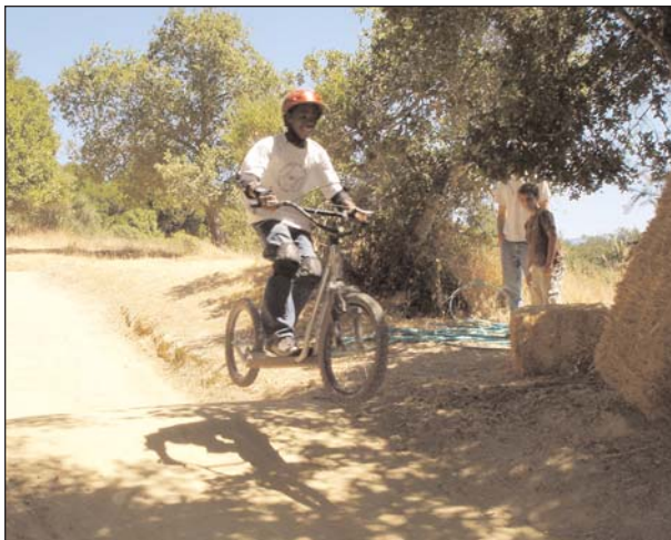
Children’s workers at First Baptist Church helped The Rock get their children’s program running by staffing their sport’s camp.

First Baptist’s sports director helped staff and lead a sports camp for The Rock. Children’s