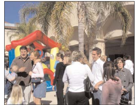
Ventura Christian Church was started in Murrieta CA on July 1 2003. With 200 in attendance, Ventura has already seen over 18 people baptized.

Many people coming into a new church plant bring preconceived notions about how to “do church.” Sometimes competing ideas can cause conflict, something that can be devastating to a fragile new church.