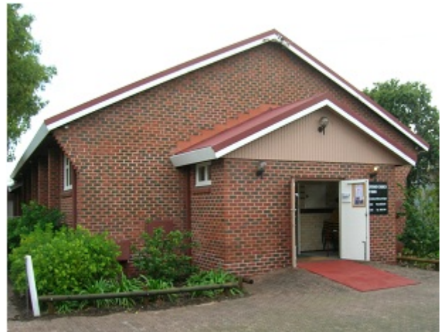
Perth CRC, Victoria Park, WA

those first 6 years, the number of members more than doubled.